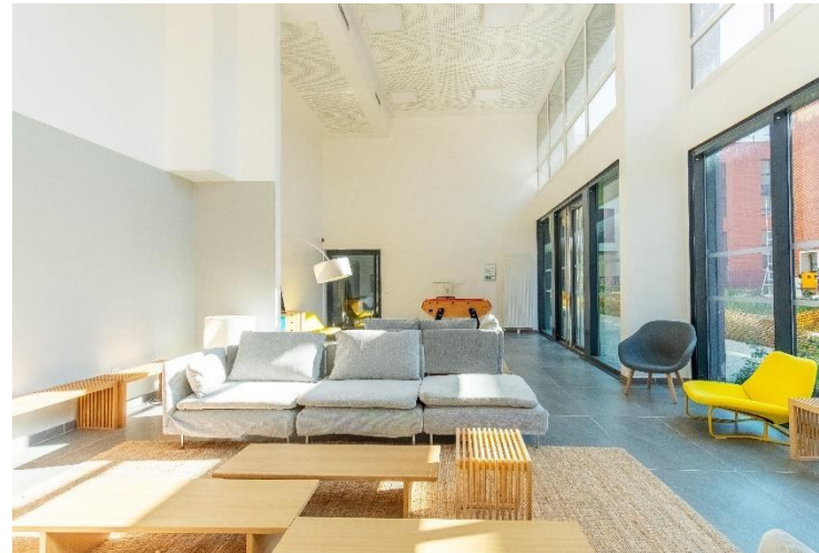
common lounge area