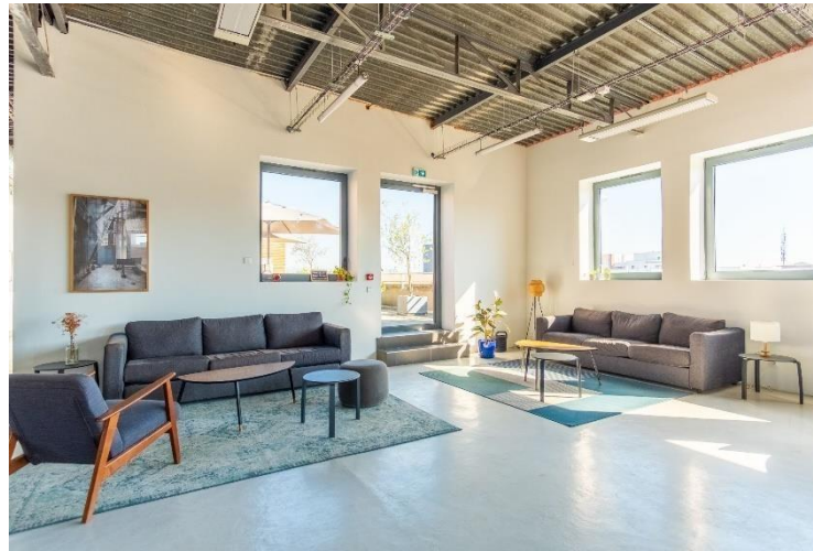
common lounge area