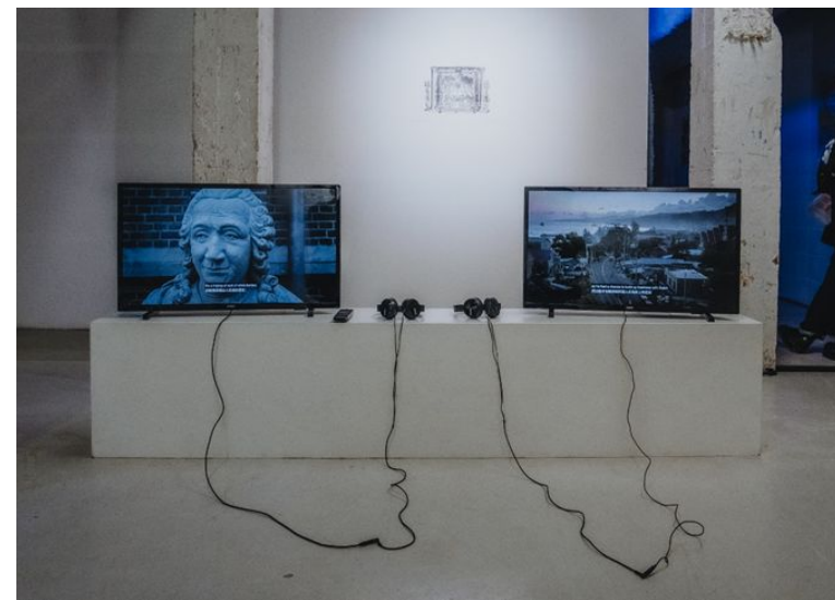
© Manuel Abella, Views of the exhibition TALENTS! Farewell, 2023 Artist – Yu Liu