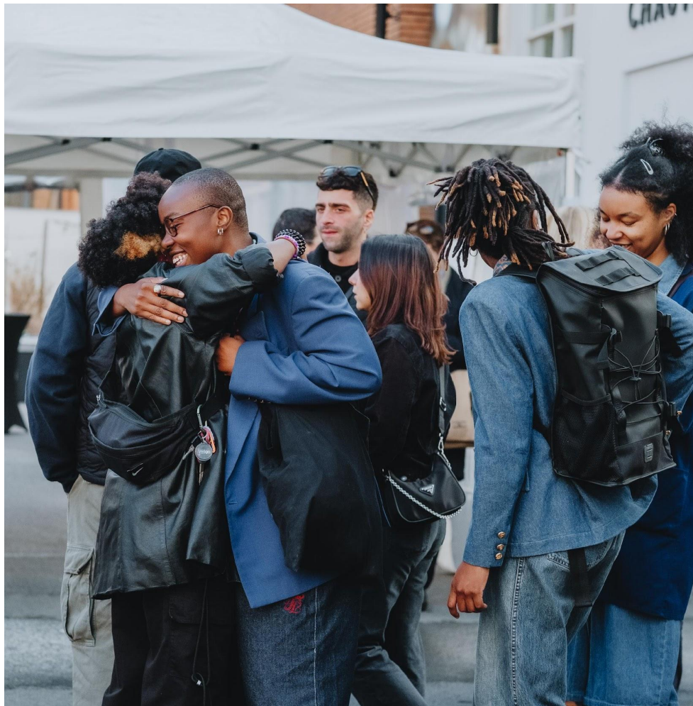
View of the exhibition opening, Gunaikeion 40 ans du Frac, 2023

An end-of-the-residency presentation is a must and the artist will also need to submit a report to the Ministry of Culture.