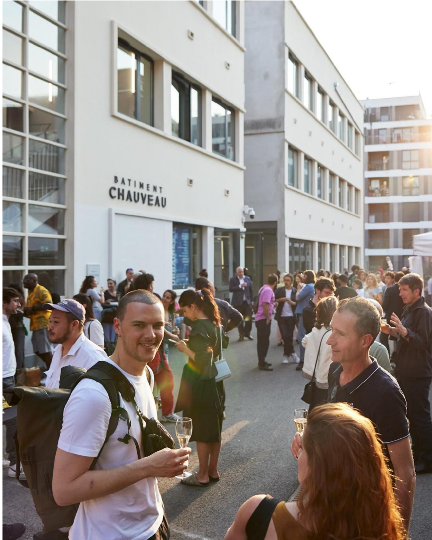
View of the exhibition opening Odyssees Urbaines, 2023

In partnership with the Taiwan Cultural Centre in Paris , on behalf of the Ministry of Culture, Taiwan (R.O.C.) , the Fondation Fiminco welcomes applications from Taiwanese artists for a 4-month research, creation and production residency in Romainville (Seine-Saint-Denis) from mid-September to mid-January 2025.