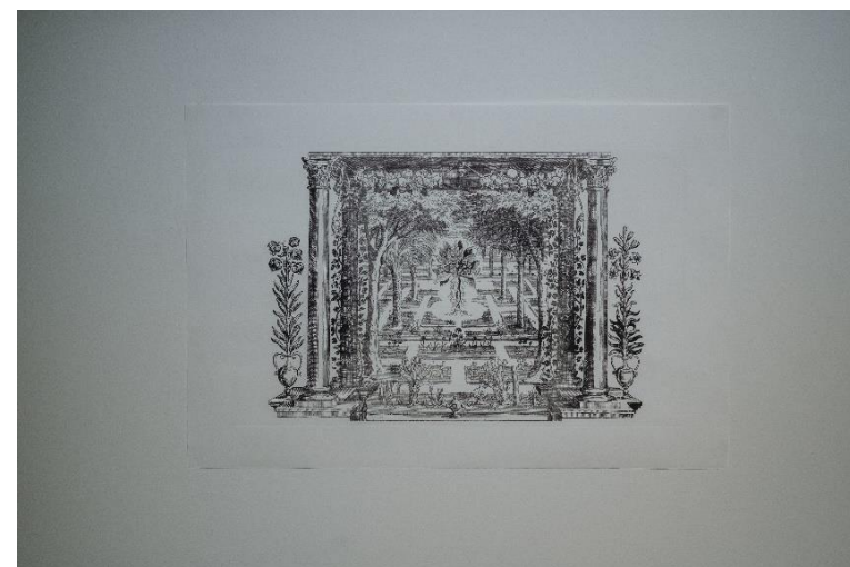
Views of the exhibition TALENTS! Farewell, 2023 Artist – Yu Liu